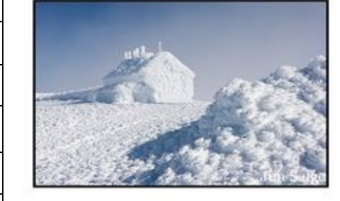
Ice covers everything at the summit of Mount Washington